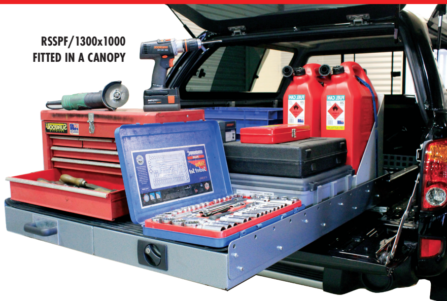
RSSPF/1300x1000 FITTED IN A CANOPY