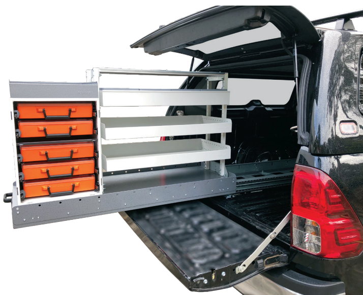
RSSPF/1300x510 FITTED IN A CANOPY

2x RSSPF/1310/300 + 2x RSSFR/HD/120/1227 + 8x RP125 + 48 RP200 + 2x RSPEP/UNV/FT + 2x RSPEP/HK FITTED IN A TOYOTA HIACE